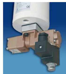
Optional: Purge-Stop Valve

Membrane dryers make use of a small quantity of the compressed air as purge air. The quantity of purge air depends, among others, on the desired pressure dew point. In the model DMM, the membrane bundle is located in a pressure-resistant housing. This construction offers the possibility to interrupt the purge air flow by means of an optionally mounted solenoid valve, which can be operated from the compressor on-off contact.